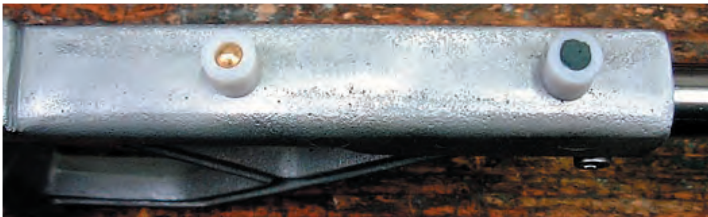
Plasticine on top of collets, release agent to alloy stock, then 5 min araldite in cheekpiece holes (1/3 full)