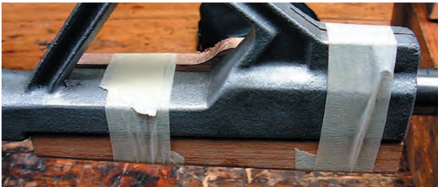
Tape into position, keep square (see below)